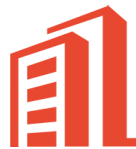
Hotel Property Management