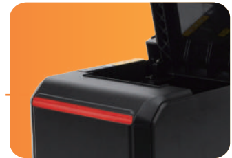
User-friendly Reminders For Paper Lacking, Cover Opening