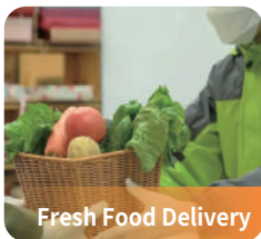
Fresh Food Delivery