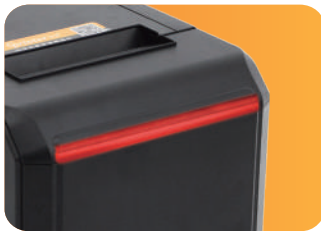
Highlighted Indicator Light Bar

Front Highlighted Indicator Light Bar, Equipped with Large Speaker Audible and Visual Dual Alarm, Outstanding Prompts and Warnings