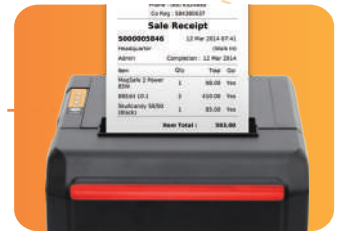
Reminder for Receipt Not Taken Away

Easily Cope With Noisy Environments Without Fear Of Orders Missing